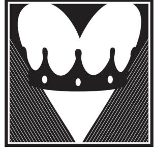
DAVID: The King